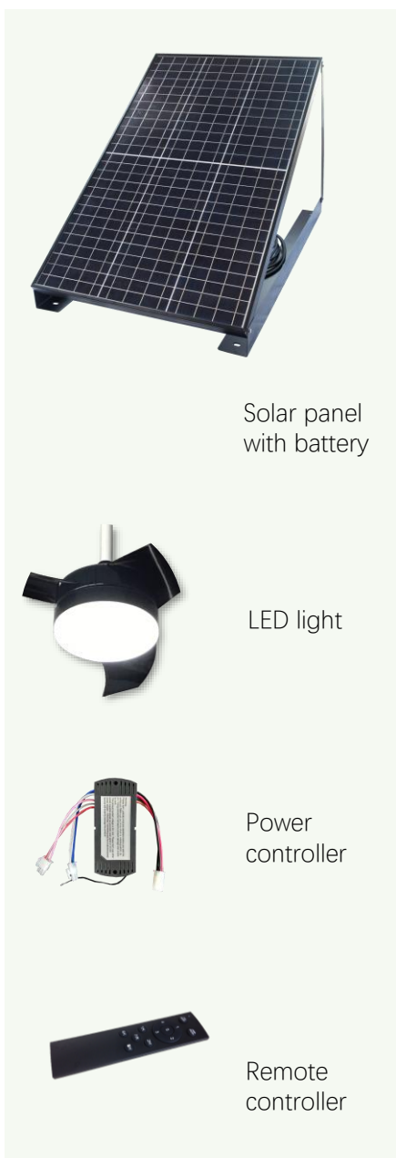
Solar panel with battery

A green new 42 inches solar ceiling fan with light powered by 35W solar panel, while with solar battery inbuilt as backup power for all day running.