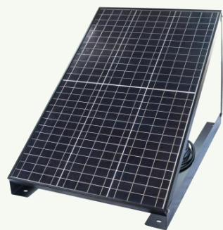
Solar panel with battery

A green new 60 inches solar ceiling fan with light powered by 40W solar panel, while with solar battery inbuilt as backup power for all day running.